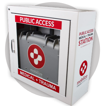
Comprehensive & Mobile ALARMED WALL CABINET