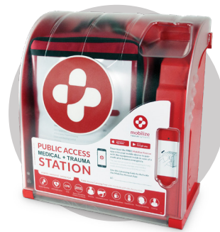
Public Access Wall Boxes